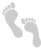
Walk-a-Thon

Anonymous Baskets and Beyond Online FASTSIGNS, Casselberry FBI - Florida Business Interiors Heintzelman's Truck Park Avenue Insurance Rotary Club of Longwood St. Luke's Lutheran Church